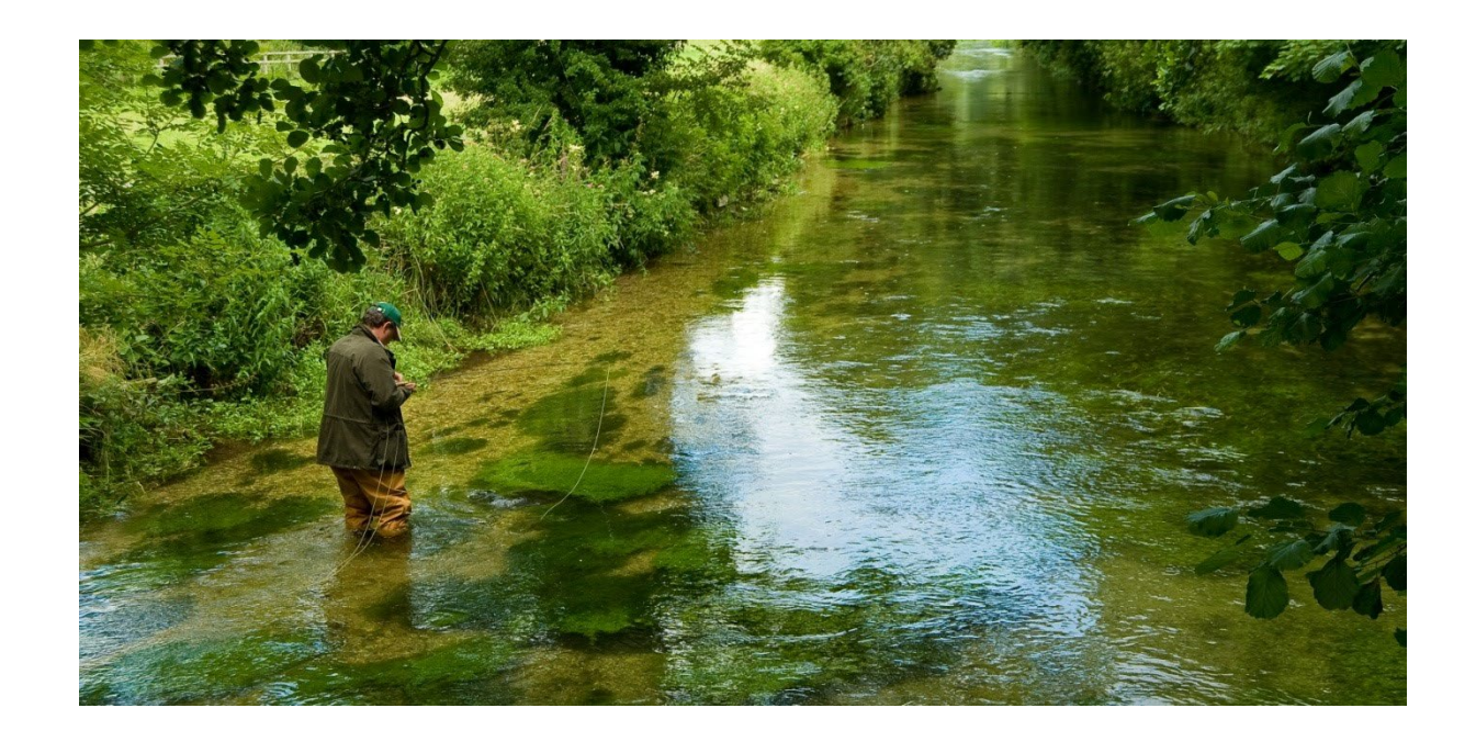
Starting point for wading Upper section

debris used to create some very effective structures that seem to be popular with both fish and fishers alike.